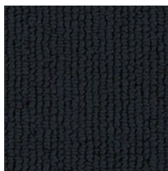
199 BLACK MAGIC