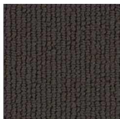
185 BROWN FOX