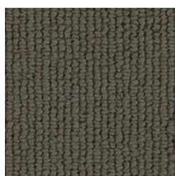
570 ANTIQUE OAK